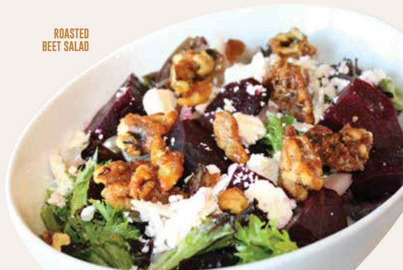
ROASTED BEET SALAD

Fresh mixed greens, sliced cucumbers, diced tomatoes and julienne carrots, served with house made balsamic vinaigrette. APPETIZER - 6 / REGULAR - 10