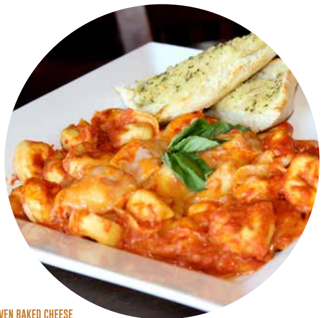
OVEN BAKED CHEESE CAPPELLETTI

Cheese stuffed cappelletti tossed in our house made blush sauce, topped with mixed cheese and baked until grown brown. Served with a garlic loaf. 16